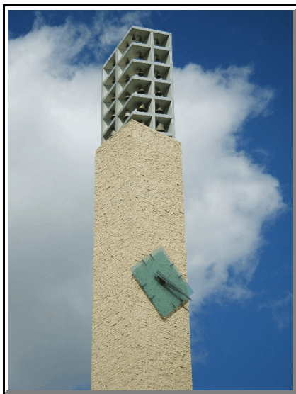
666 Bell Tower at City Hall

The symbolism of Satanism and the remarkable integration of the Talmud into Commerce is everywhere. It is the foundation of their working belief system that is based on the loop theory I described above. They are having an absolute feeding frenzy at this point in time and with the wars that they got going on and coming it is pure gluttony. The Edmonton City Hall for example is reported to have exactly 666 windows in it and outside on the bell tower there are 3 columns of 6 sections, yet 666 again. The Pyramids on the roof are not perpendicular to each side but distorted in shape reflecting unbalanced energy held within.