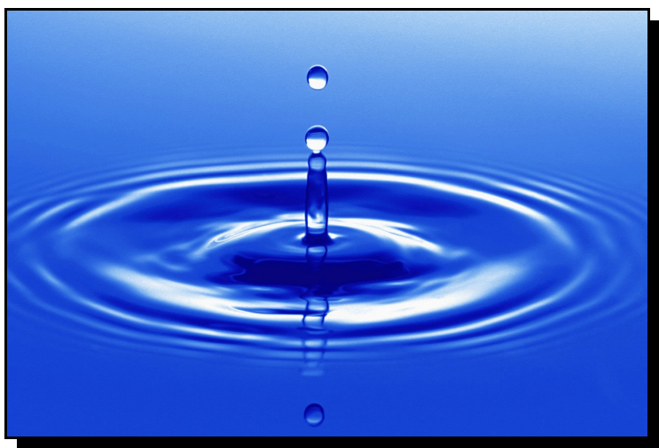
The Structure of Light

You might need a little time to think through that last section so don't start this part until you feel comfortable, with what you just learned. Playtime with light is all about accessing the programming of the mirror. I kind of wanted to give you a bit of heads up on this before we move into the next chapter as many of you may never have had the opportunity to play with