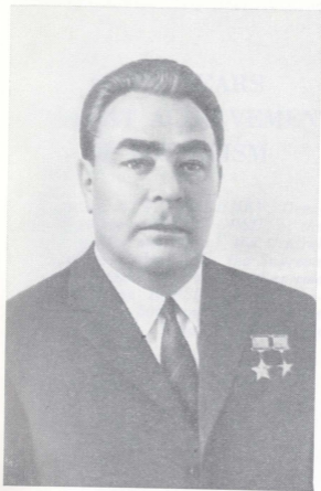
L. I. BREZHNEV